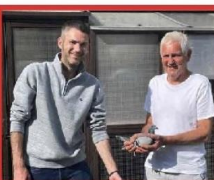
2nd Section H, C Crick & Son