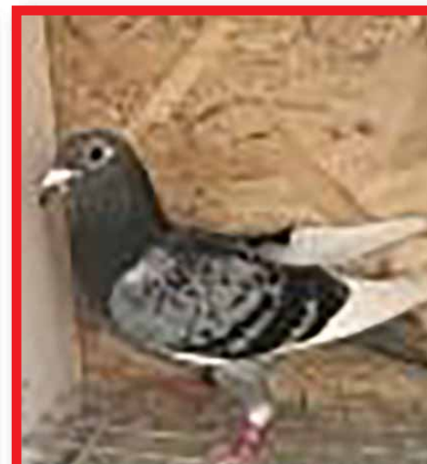
2nd Section D.