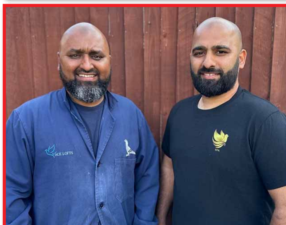
ACE Lofts 2nd Open, 1st Section E. ACE Lofts 2nd Open, 1st Section E.