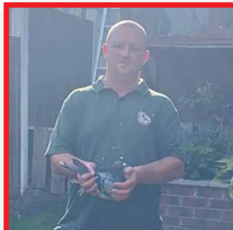
John Wood & Son, 3rd Section L.