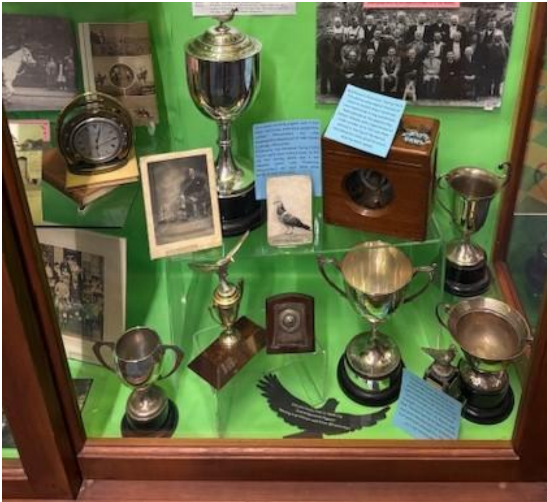
The display at Ilfracombe Museum, which will remain for the remainder of 2025

See below the relevant extract from the NFC's Roll of Honour